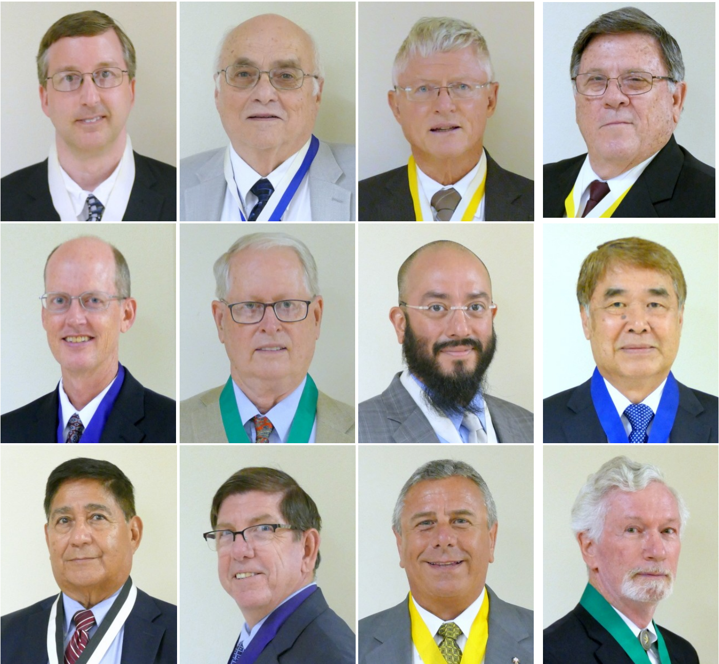
Above are the newly elected officers for 2017-2018